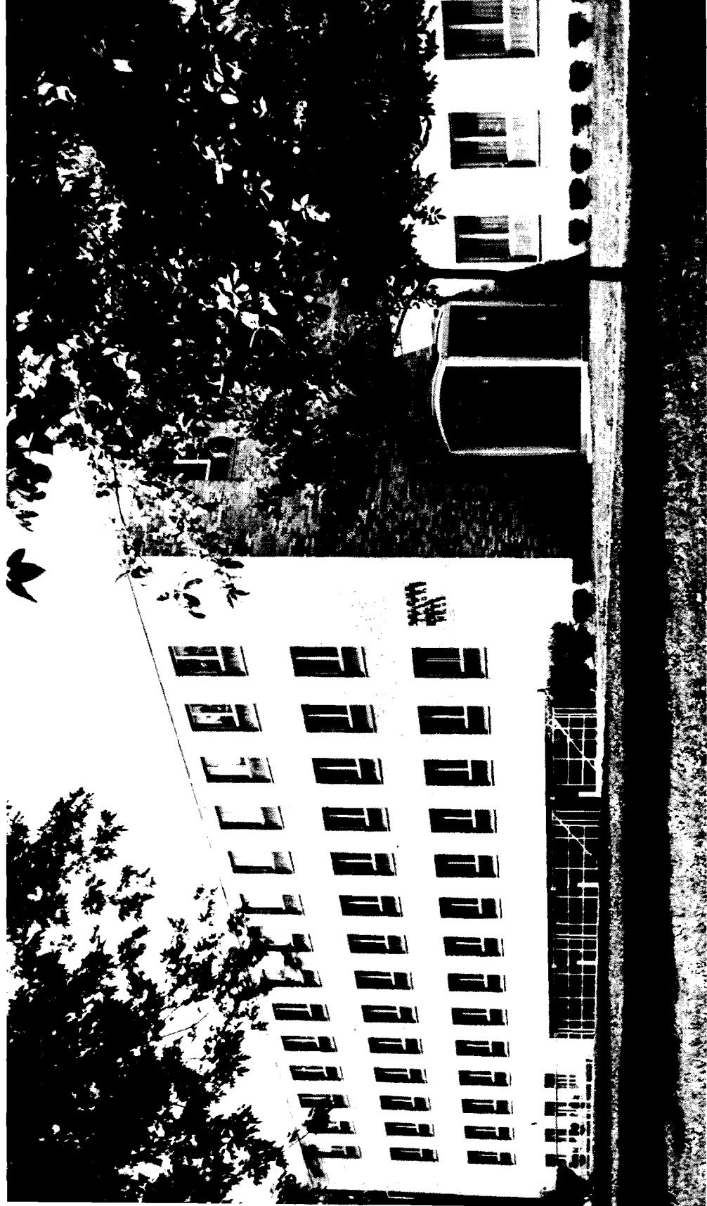
Scholar Hall is the newest of three campus dormitories. The back story is posted in the back of the book.